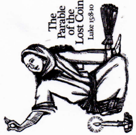
The Parable of the Lost Coin Luke 15:8-10